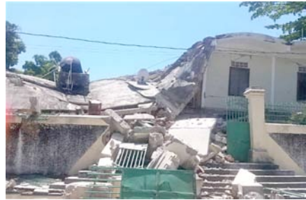
Earthquake destruction in Haiti

Caritas Australia's thoughts and prayers are with the people of the Haiti who have been devastated by a 7.2 magnitude earthquake. Over 1,900 people have died, and thousands more left injured. Homes, churches and schools have been damaged in the quake, and reports indicate that more than 37,000 families have been left homeless.